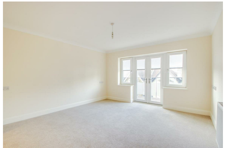
Lounge 13'4 x 13' (4.06m x 3.96m)

Fitted carpet. French doors with adjoining side windows leading onto own private balcony: